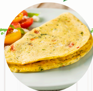
Serving suggestion 120g Omelette