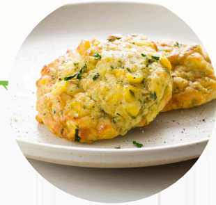
Serving suggestion 2x50g fritters