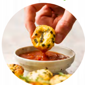
As a Snack