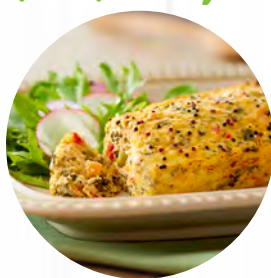
With a Salad