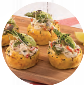
As a Build