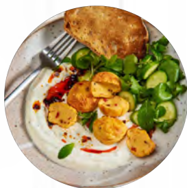
With a Salad