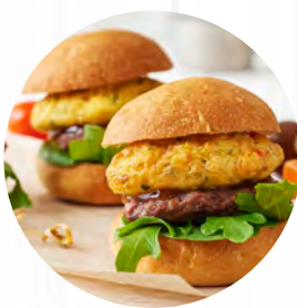
As a Build