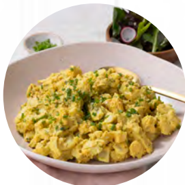
In a Salad