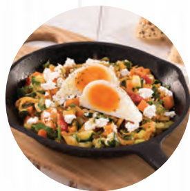
Hot Dishes (Homestyle)

PERFECTLY POACHED, EVERY TIME - IMPRESS WITH DELICIOUS, RICH CREAMY YOLKS. 56 PROTEIN PER EGG. SUPER VERSATILE: USE FOR BURGERS, WRAPS, SANDWICHES OR SALADS.