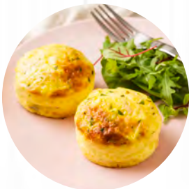
With a Salad

IF YOU LOVE EGGS, YOU WILL LOVE OUR EGG BAKES! LIGHT, FLUFFY & FULL OF FLAVOUR. PERFECT FOR BREAKFAST OR SERVED WITH A SALAD FOR A DELICIOUS LIGHT HIGH PROTEIN MEAL.