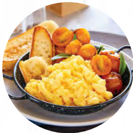
As a Side