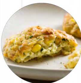
As a Side