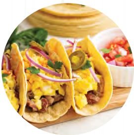
In a Wrap or Taco