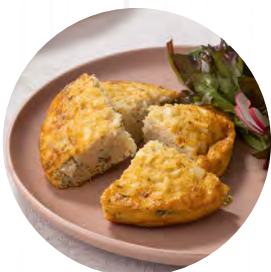
As a Main