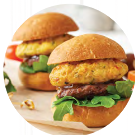
In a Burger