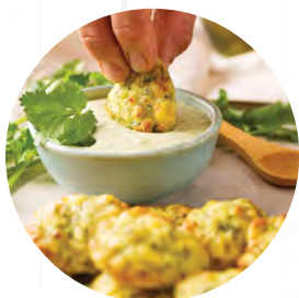
As a Snack

OUR WIDE RANGE OF DELICIOUS FRITTERS ARE THE PERFECT ADDITION TO ANY MEAL YOUR CUSTOMERS WILL LOVE. BURSTING WITH FLAVOUR AND FILLED WITH GOODNESS, THEY ARE PERFECT ANY TIME OF DAY.