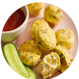
As a Snack

OUR DELICIOUS AND FLUFFY EGG BITES ARE PACKED WITH GOODNESS! HIGH PROTEIN AND BURSTING WITH FLAVOUR, THEY ARE PERFECT AS AN ALL-DAY SNACK, A HEALTHY BREKKIE ON THE GO, OR EVEN ON TOP OF A SALAD - THE POSSIBILITIES ARE ENDLESS.