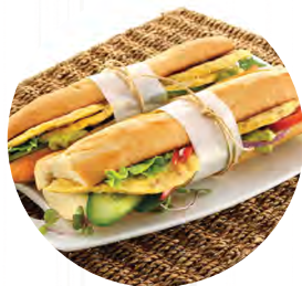
As a Build

Available in six delicious flavours: Plain; Spinach & Fetta; Ham & Cheese; Cheese & Chives; Spanish and Tomato, Mozzarella & Basil.