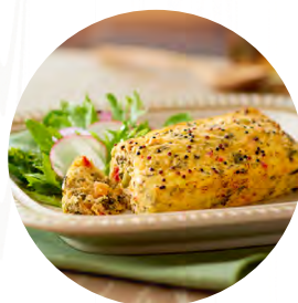
With a Salad