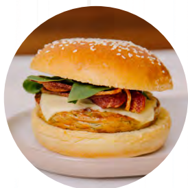
In a Burger