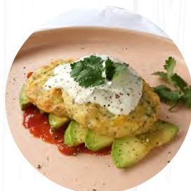
As a Build

Available in four delicious flavours: Corn & Zucchini (60g), Pumpkin, Spinach & Fetta (50g), Carrot & Pumpkin (50g), Bubble & Squeak (50g).