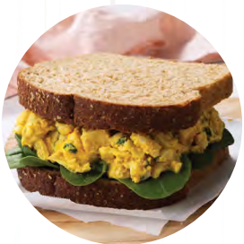
In a Sandwich