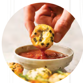
Parties & Platters

Available in three delicious flavours: Ham & Cheese; Fetta & Spinach; Caramelised Onion & Parmesan.