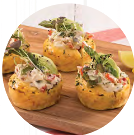
As a Build

Available in two delicious flavours: Fetta & Spinach; Ham & Cheese.