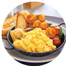
As a Side

Super versatile, perfect to serve in a buffet, plated but also in wraps, tacos, on toast or as a side.