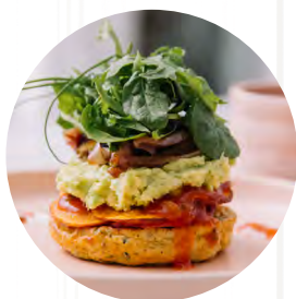
As a Build