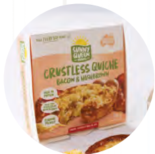
Crustless Quiche Bacon & Hashbrown

HIGH PROTEIN MEALS MADE EASY WITH OUR WIDE RANGE OF ON-THE-GO PRODUCTS. THERE IS AN OPTION FOR ANY TIME OF DAY - WHETHER YOU ARE LOOKING FOR A HEALTHY BREKKIE, ALL-DAY SNACK OR A FULL MEAL, WE HAVE YOU COVERED!