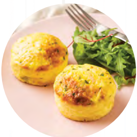
With a Salad