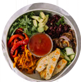
In a Bowl