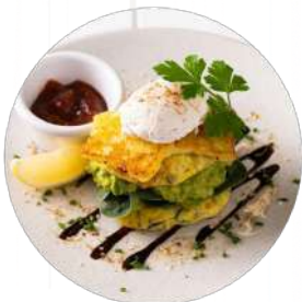
As a Stack