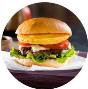
As a burger

SHAKE UP YOUR MENU WITH HEALTHY CHOICES! WE'VE CREATED A FLUFFY OMELETTE PATTY FOR THE ULTIMATE HIGH PROTEIN STACK! PERFECT FOR BREKKIE BURGERS, SANDWICHES, WRAPS OR IN A BUILD.