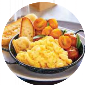
As a Side

Super versatile, perfect to serve in a buffet, plated but also in wraps, tacos, on toast or as a side.