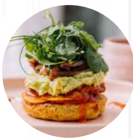
As a Build