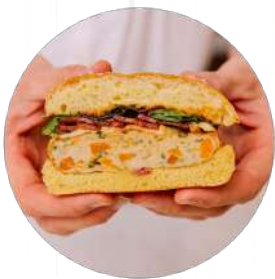
In a Burger