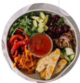
In a Bowl