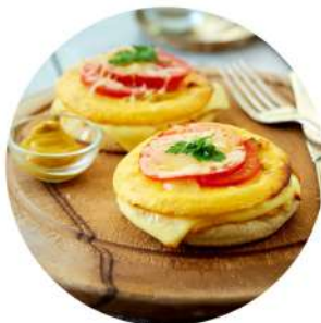
In a build

More flavours and sizes upon request (MOQ's required).