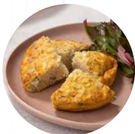
As a Main