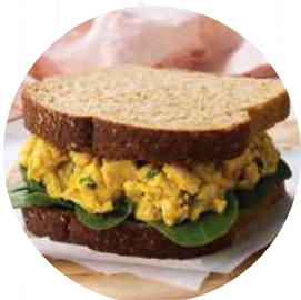
In a Sandwich

COOKED, PEELED, CHOPPED AND READY-TO-USE! MADE FROM 100% FRESH AUSSE EGGS, IT IS PERFECT FOR SANDWICHES, WRAPS, EGG SALADS OR EVEN ON PIZZA - THE OPPORTUNITIES ARE ENDLESS.