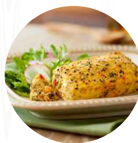
With a Salad