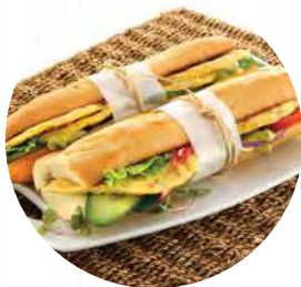
As a Build

Available in six delicious flavours: Plain; Spinach & Fetta; Ham & Cheese; Cheese & Chives; Spanish; Tomato, Mozzarella & Basil.