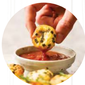
Parties & Platters

Available in ...Melicious flavour: Fetta & SpinachU