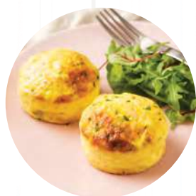
With a Salad