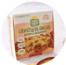
Crustless Quiche Bacon & Hashbrown 120g

HIGH PROTEIN MEALS MADE EASY WITH OUR WIDE RANGE OF ON-THE-GO PRODUCTS. THERE IS AN OPTION FOR ANY TIME OF DAY - WHETHER YOU ARE LOOKING FOR A HEALTHY BREKKIE, ALL DAY SNACK OR A FULL MEAL, WE HAVE YOU COVERED!