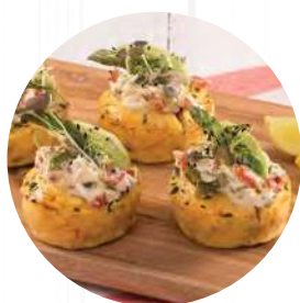
As a Build

Available in two delicious flavours: Fetta & Spinach; Ham & Cheese.