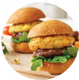
In a Burger