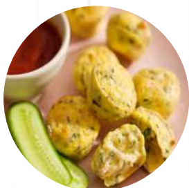
As a Snack