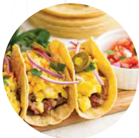
In a Wrap or Taco

CREATE DELICIOUS AND CREAMY HOME-STYLE SCRAMBLED EGGS IN NO TIME - CONSISTENT HIGH-QUALITY RESULTS EVERY TIME.