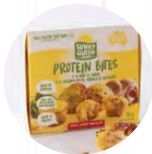
Omelette Bites 100g