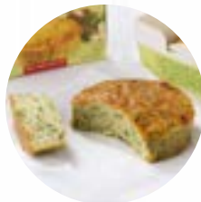
Frittata Rosemary, Spinach & Fetta