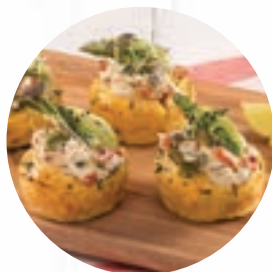
As a Build

Available in a delicious flavour: Fetta & Spinach