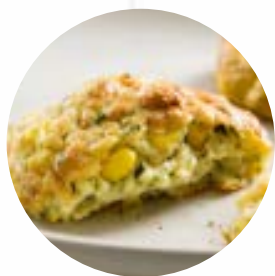
As a Side