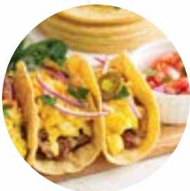
In a Wrap or Taco