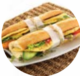
As a Build

Available in 5 delicious flavours: Plain; Spinach & Fetta; Cheese & Chives; Spanish; Tomato, Mozzarella & Basil (NEW).