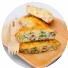
As a Snack