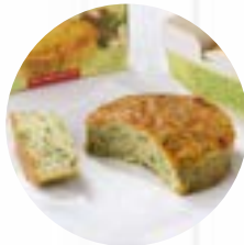
Frittata Rosemary, Spinach & Fetta