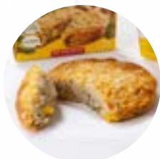
Crustless Quiche Veggie & Hashbrown

HIGH PROTEIN MEALS MADE EASY WITH OUR WIDE RANGE OF ON-THE-GO PRODUCTS. THERE IS AN OPTION FOR ANY TIME OF DAY - WHETHER YOU ARE LOOKING FOR A SNACK OR A FULL MEAL, WE HAVE YOU COVERED!