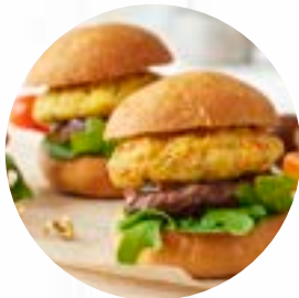
As a Build