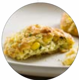
As a Side