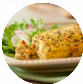
With a Salad

Available in 3 delicious flavours: Spinach, Fetta & Rosemary (round); Vegetable (square); Sweet Potato & Caramelised Onion (square, NEW).