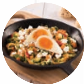
Hot Dishes (Homestyle)

PERFECTLY POACHED, EVERY TIME - IMPRESS WITH DELICIOUS, RICH CREAMY YOLKS. 56 PROTEIN PER EGG. SUPER VERSATILE: USE FOR BURGERS, WRAPS, SANDWICHES OR SALADS.