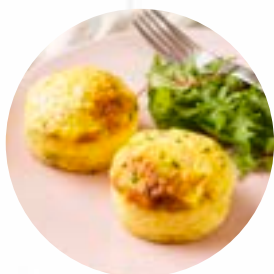
With a Salad

IF YOU LOVE EGGS, YOU WILL LOVE OUR EGG BAKES! LIGHT, FLUFFY & FULL OF FLAVOUR. PERFECT FOR BREAKFAST OR SERVED WITH A SALAD FOR A DELICIOUS LIGHT HIGH PROTEIN LUNCH.