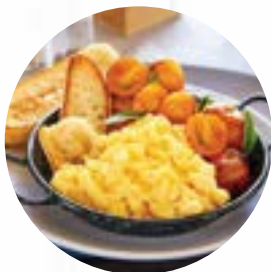
As a Side

Super versatile, perfect to serve in a buffet, plated but also in wraps, tacos, on toast or as a side.