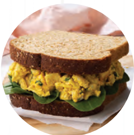
In a Sandwich