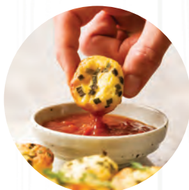
Parties & Platters

Available in three delicious flavours: Ham & Cheese; Fetta & Spinach; Caramelised Onion & Parmesan.