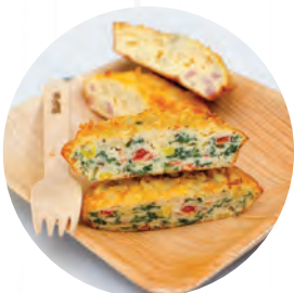
As a Snack