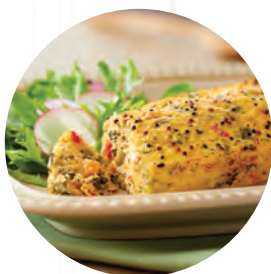
With a Salad

Available in two delicious flavours: Vegetable (rectangle); Sweet Potato & Caramelised Onion (rectangle).