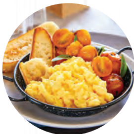
As a Side

Super versatile, perfect to serve in a buffet, plated but also in wraps, tacos, on toast or as a side.