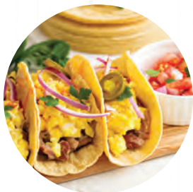
In a Wrap or Taco

CREATE DELICIOUS AND CREAMY HOME-STYLE SCRAMBLED EGGS IN NO TIME - CONSISTENT HIGH-QUALITY RESULTS EVERY TIME.