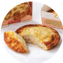
Crustless Quiche Bacon & Hashbrown

HIGH PROTEIN MEALS MADE EASY WITH OUR WIDE RANGE OF ON-THE-GO PRODUCTS. THERE IS AN OPTION FOR ANY TIME OF DAY - WHETHER YOU ARE LOOKING FOR A HEALTHY BREKKIE, ALL DAY SNACK OR A FULL MEAL, WE HAVE YOU COVERED!