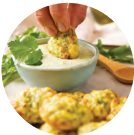
As a Snack