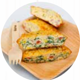
As a Snack