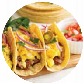
In a Wrap or Taco