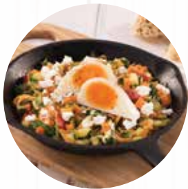
Hot Dishes (Homestyle)

PERFECTLY POACHED, EVERY TIME - IMPRESS WITH DELICIOUS, RICH CREAMY YOLKS. 56 PROTEIN PER EGG. SUPER VERSATILE: USE FOR BURGERS, WRAPS, SANDWICHES OR SALADS.