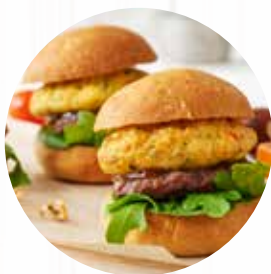
As a Build