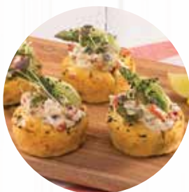
As a Build

Available in 2 delicious flavours: Fetta & Spinach; Ham & Cheese.