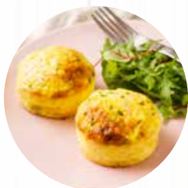
With a Salad

IF YOU LOVE EGGS, YOU WILL LOVE OUR EGG BAKES! LIGHT, FLUFFY & FULL OF FLAVOUR. PERFECT FOR BREAKFAST OR SERVED WITH A SALAD FOR A DELICIOUS LIGHT HIGH PROTEIN LUNCH.