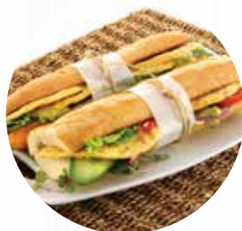
As a Build

Available in 6 delicious flavours: Plain; Spinach & Fetta; Ham & Cheese; Cheese & Chives; Spanish; Tomato, Mozzarella & Basil (NEW).