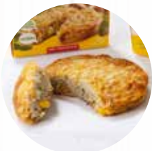
Crustless Quiche Veggie & Hashbrown