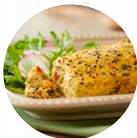
With a Salad

Available in 3 delicious flavours: Spinach, Fetta & Rosemary (round); Vegetable (square); Sweet Potato & Caramelised Onion (square, NEW).