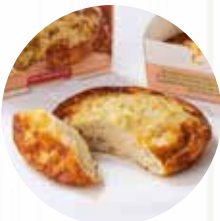
Crustless Quiche Bacon & Hashbrown