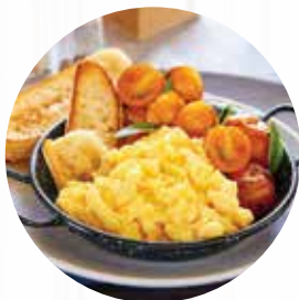
As a Side

Super versatile, perfect to serve in a buffet, plated but also in wraps, tacos, on toast or as a side.