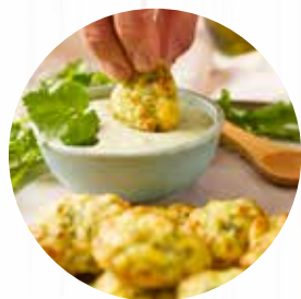
As a Snack

OUR WIDE RANGE OF DELICIOUS FRITTERS ARE THE PERFECT ADDITION TO ANY MEAL YOUR CUSTOMERS WILL LOVE. BURSTING WITH FLAVOUR AND FILLED WITH GOODNESS, THEY ARE PERFECT ANY TIME OF DAY.