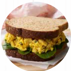
In a Sandwich