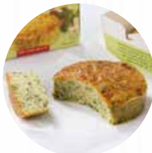
Frittata Rosemary, Spinach & Fetta