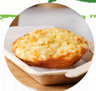
Serving suggestion 120g Crustless Quiche