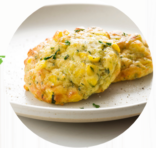
Serving suggestion 2x50g fritters